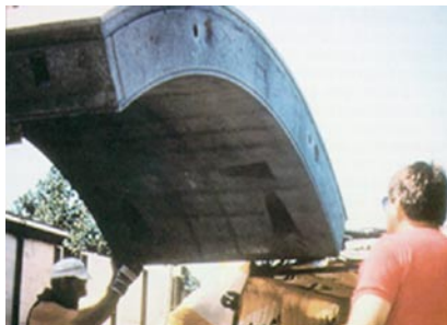
Pre-cast concrete liner segment.

The Point Loma Tunnel Outfall will convey and discharge to the ocean excess effluent from new water reclamation plants currently under construction or being planned. The outfall will also serve the existing wastewater treatment plant and partly replace the existing near shore outfall, which connects to the new ocean outfall extension completed in 1993. The Point Loma Tunnel Outfall comprises four major components, the headworks, the tunnel, the tie-in structure and marine works.