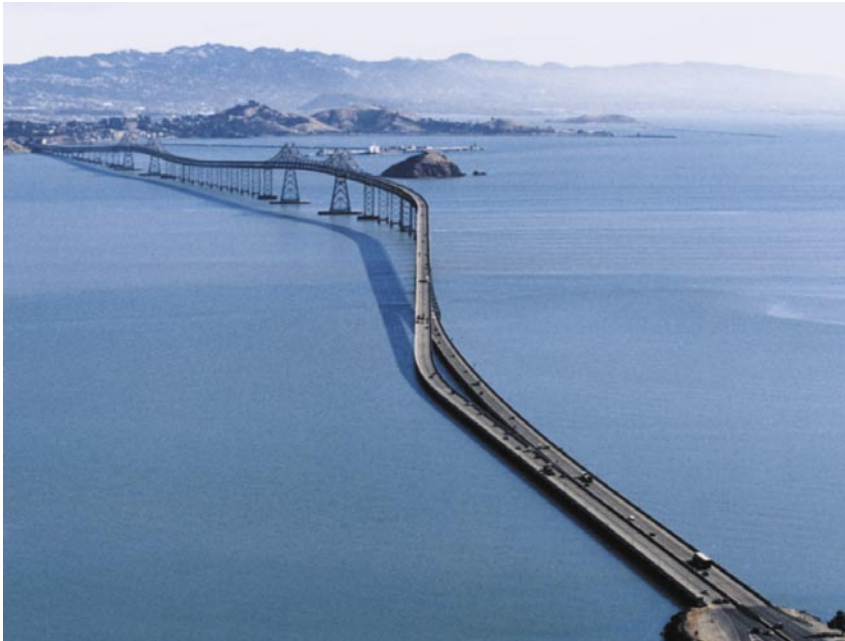
Aerial view of the Richmond - San Rafael Bridge.

As part of the seismic retrofit design of the Richmond – San Rafael Bridge, Ben C. Gerwick, Inc. developed a concept of using precast concrete jackets to strengthen the existing concrete piers. Unlike steel jackets, concrete jackets can be designed to resist corrosion in the aggressive tidal-splash zone for the remaining 100-year life expectancy of the bridge. A concrete mix with a low water-cement ratio, fly ash, and moderate amounts of an active pozzolan will be specified to allow the jackets to be constructed using a 2.5-inch minimum concrete cover with uncoated reinforcement. The concrete in the splash and tidal zone will receive a polyurea coating. This reduced cover impedes micro cracking and reduces the weight of the jackets.