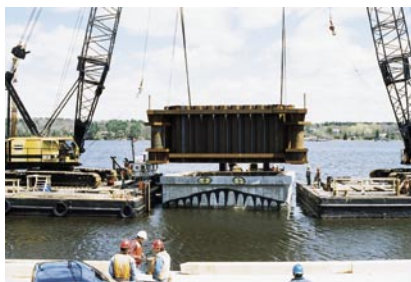
Design-build of foundations for the Bath-Woolwich Bridge, ME.

The Gerwick organization has a track record of successful value engineering both during the proposal stage and also during the construction phase. Because of our past experience as contractors, the staff at Gerwick is best able to understand contractor's concerns and issues.