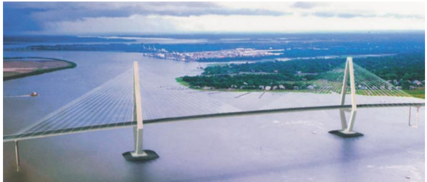
Cooper River Bridge design-build of pier protection islands, large-diameter drilled shafts, and dredging.

Coupled with engineering expertise Gerwick is able to offer sound engineering solutions on a timely and cost effective basis with our contractor partners.