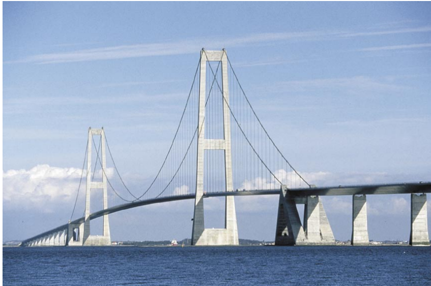
The Great Belt East Bridge, Denmark.

IBDAS (Integrated Bridge Design and Analysis System) is a powerful software package developed by COWI for integrated design and analysis of load bearing structures. The name indicates that the system contains special facilities for bridge design but the program can advantageously be used for almost any structural design project.